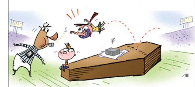
ABOVE AND RIGHT

It's really just the two kids I worry about.